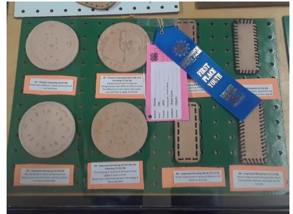
Leather I Practice board Example

Practice Board: On a 12"x18"x1/8" or 1/4" piece of pegboard, attach items that illustrate the skills you have learned and show a progression. ( use coasters to show progression )