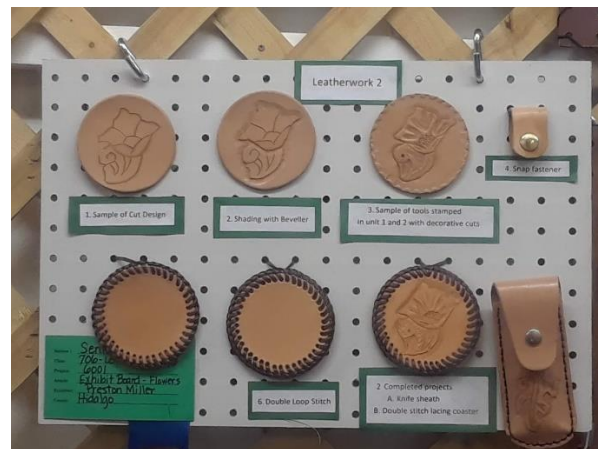
Leather II Practice board Examples