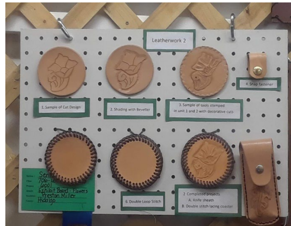
Leather II Practice board Examples